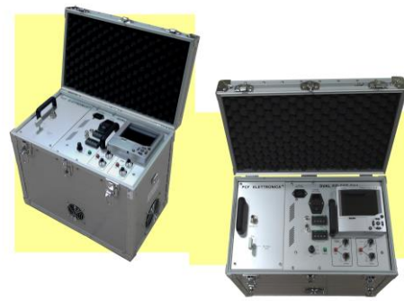
Mod. C 2011 with top lead open

The H ions bind to the oxygen in the air generating water, while the C ions that are formed as a result of the oxidation C_x = CO , are proportional to the concentration of hydrocarbons present; moving in an electrostatic field (anode and cathode) they are attracted to one of the polarities, triggering an ionic current proportional to the concentration of the sample.