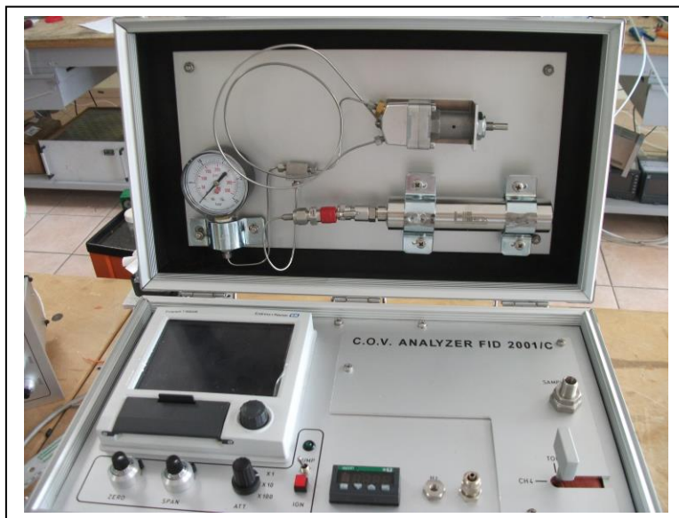
The Hydride Device mounted on the aluminium cover inside the VOC portable monitor