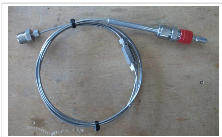
The Hydride Device with the special supplied pipe for the connection to primary H 2 source (H 2 Gas Cylinder or H 2 Generator)